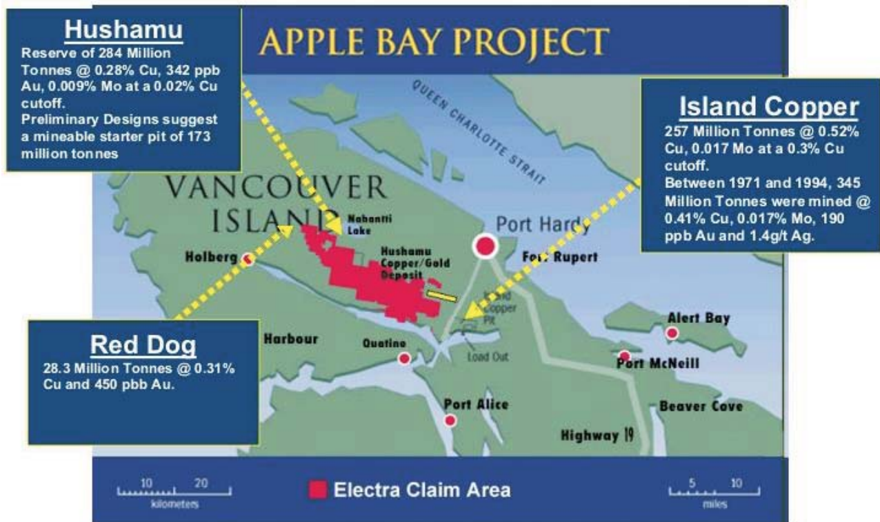
Electra's Projects on Vancouver Island