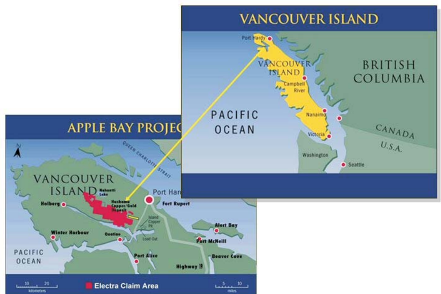
Project Location Maps